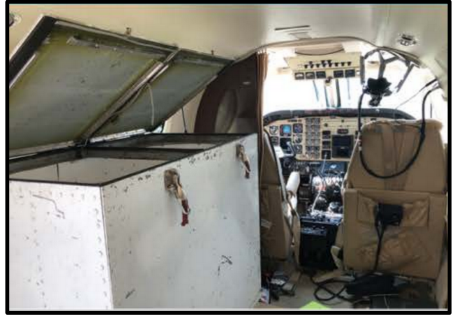
Dry ice dispenser on King Air C90 aircraft (N709EA in 2022).