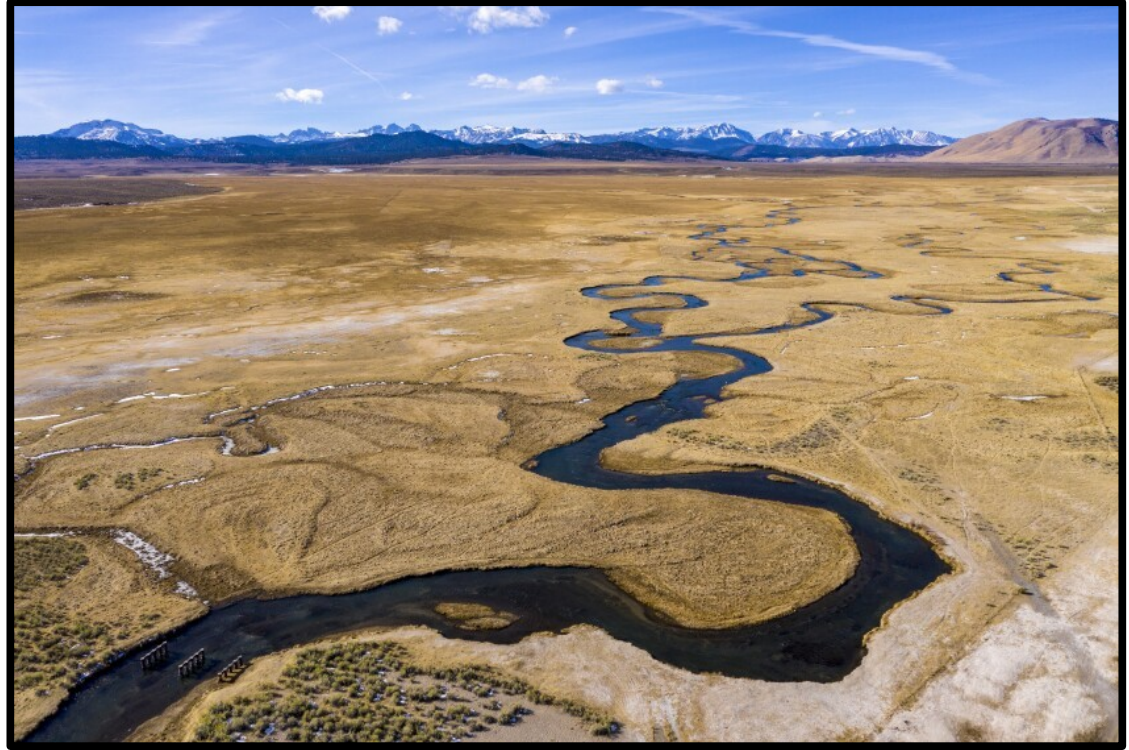
Image of a river in an dry region.